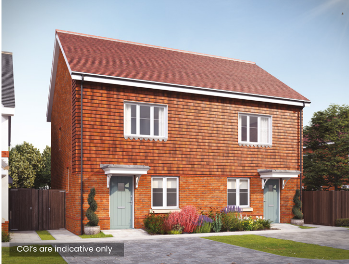
CGI's are indicative only

Little Green, Aylesbury Road, Aston Clinton, Buckinghamshire, HP22 5AQ