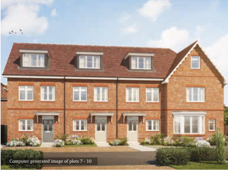
Computer generated image of plots 7 - 10

LANGLEY ROAD | STAINES-UPON-THAMES | SURREY | TW18 2EH