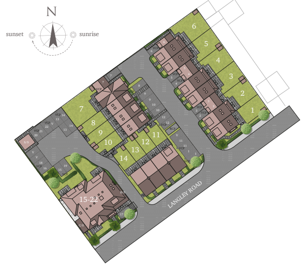
This site plan is a guide for illustrative purposes only. Landscaping shown is indicative only.