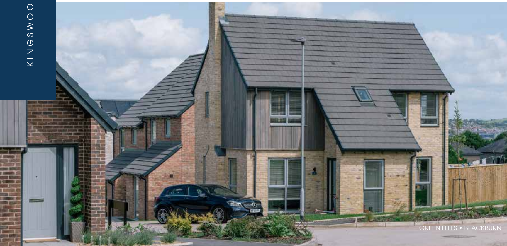
GREEN HILLS • BLACKBURN