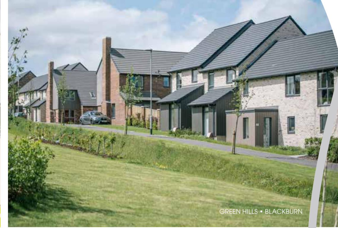
GREEN HILLS • BLACKBURN