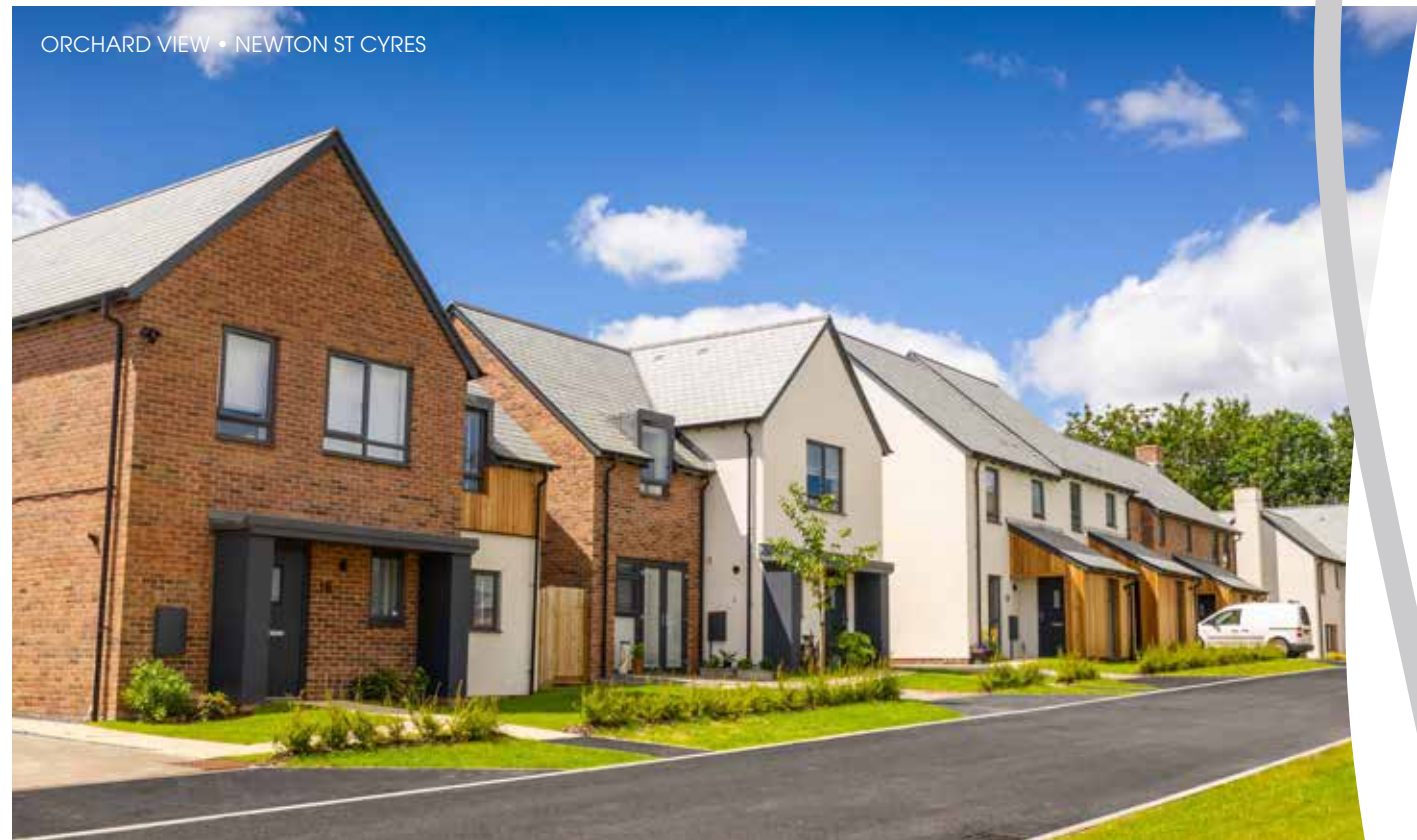
ORCHARD VIEW • NEWTON ST CYRES