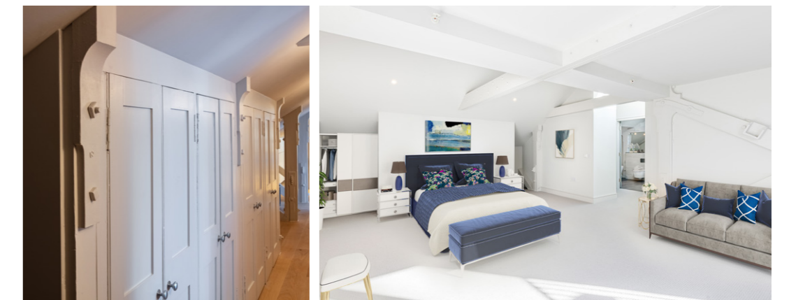
Photography shown is a mixture of computer enhanced images and similar apartments at Donaldson's and is for illustrative purposes only.