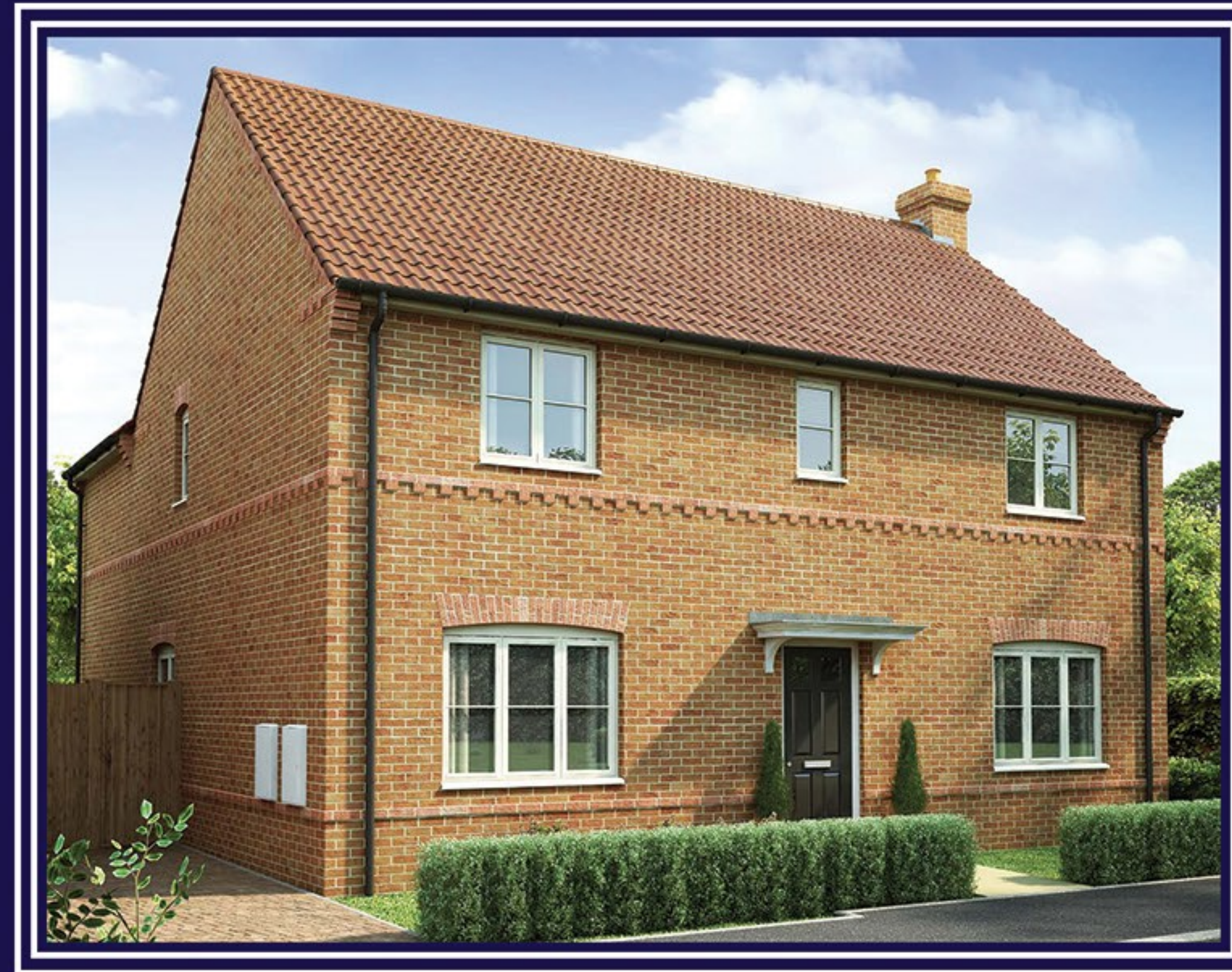
A four bedroom home with plenty of storage and living space.