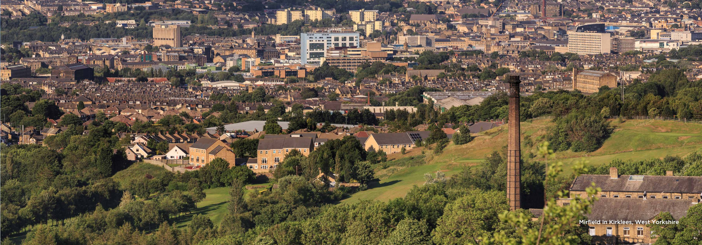
Mirfield in Kirklees, West Yorkshire