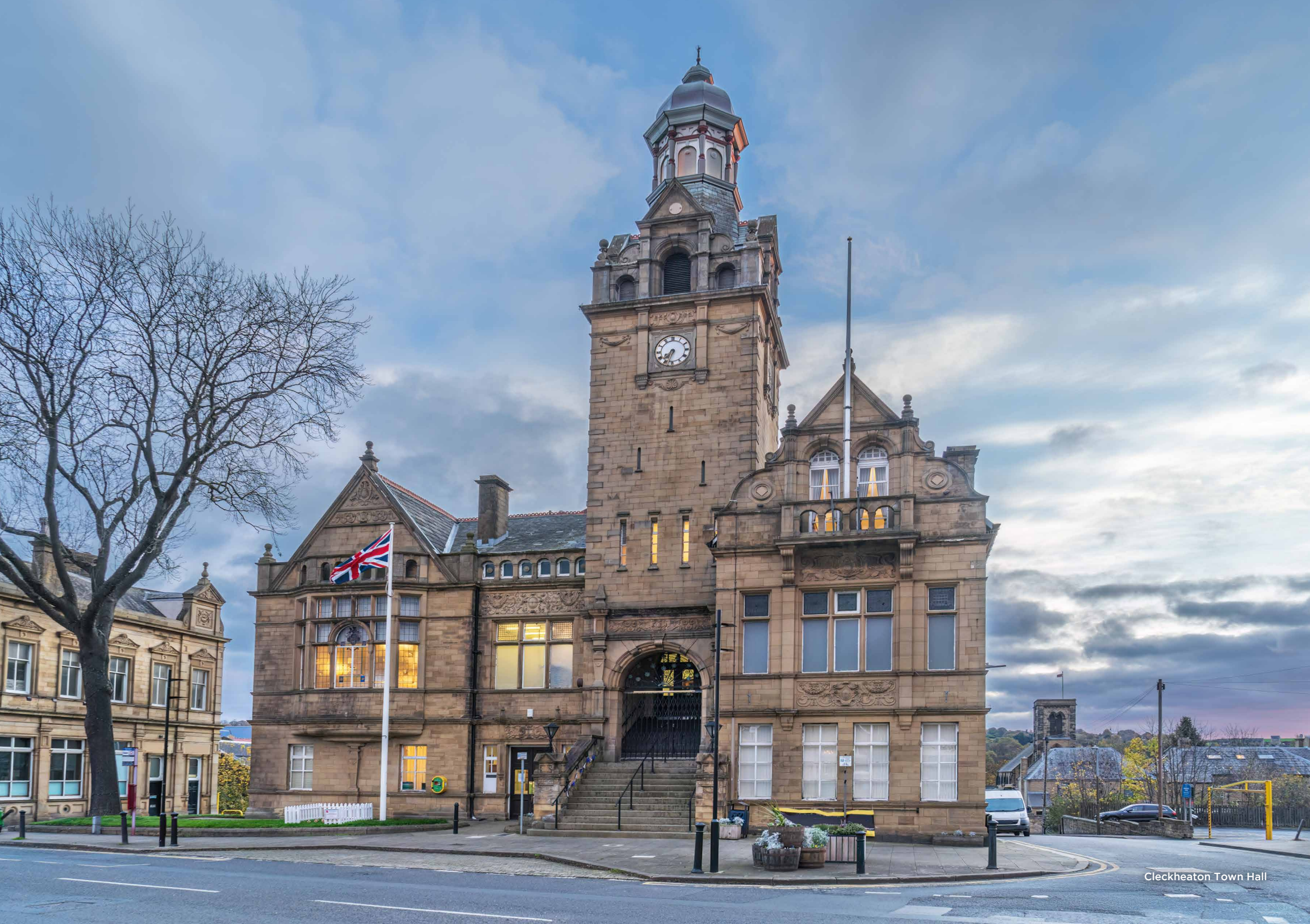
Cleckheaton Town Hall