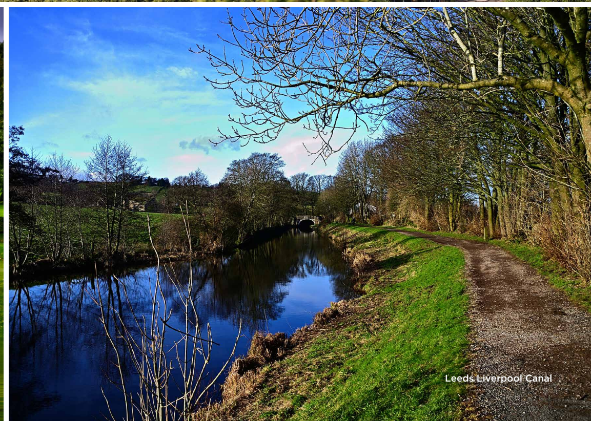
Leeds Liverpool Canal