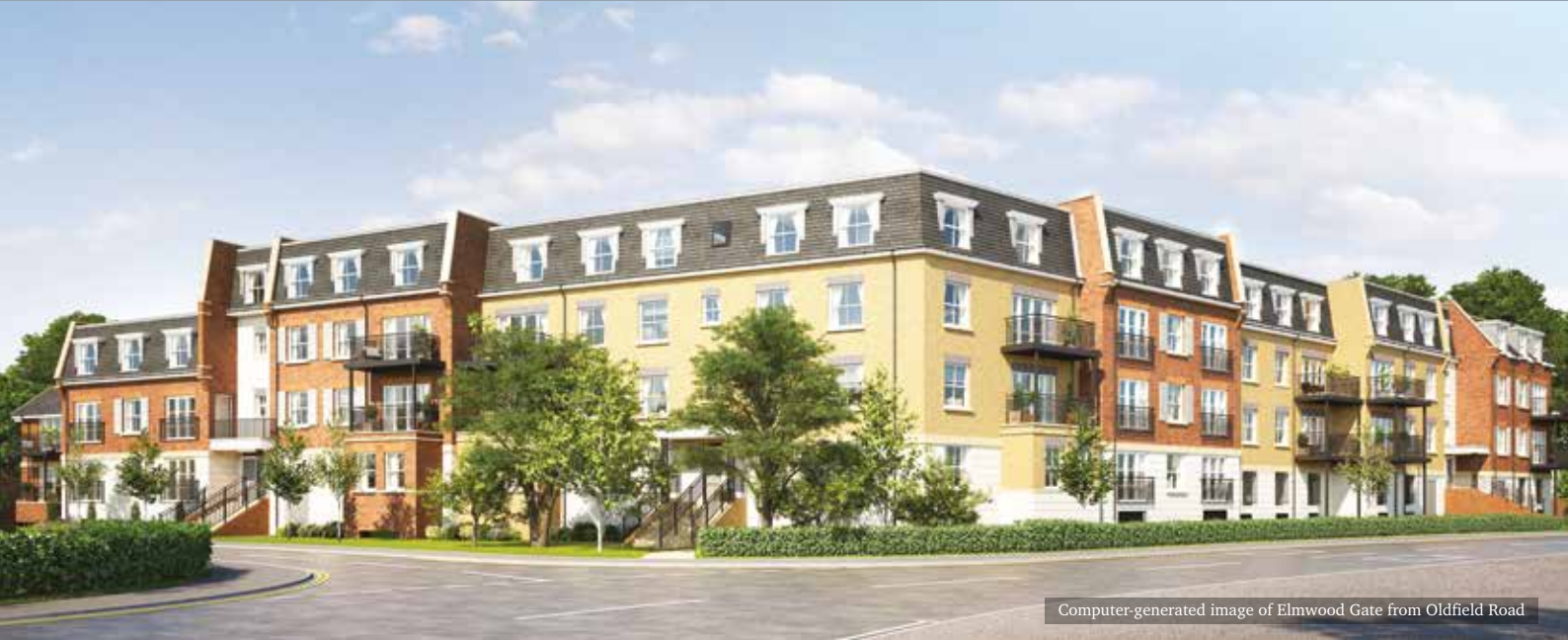
Computer-generated image of Elmwood Gate from Oldfield Road