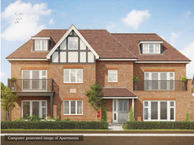
Computer generated image of Apartments

LANGLEY ROAD | STAINES-UPON-THAMES | SURREY | TW18 2EH