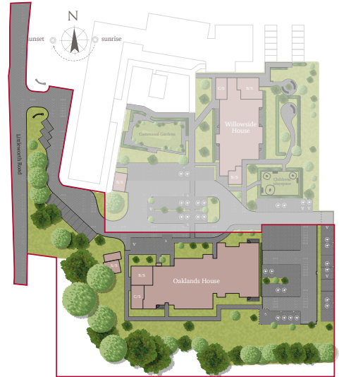
This site plan is a guide for illustrative purposes only. Landscaping shown is indicative only.