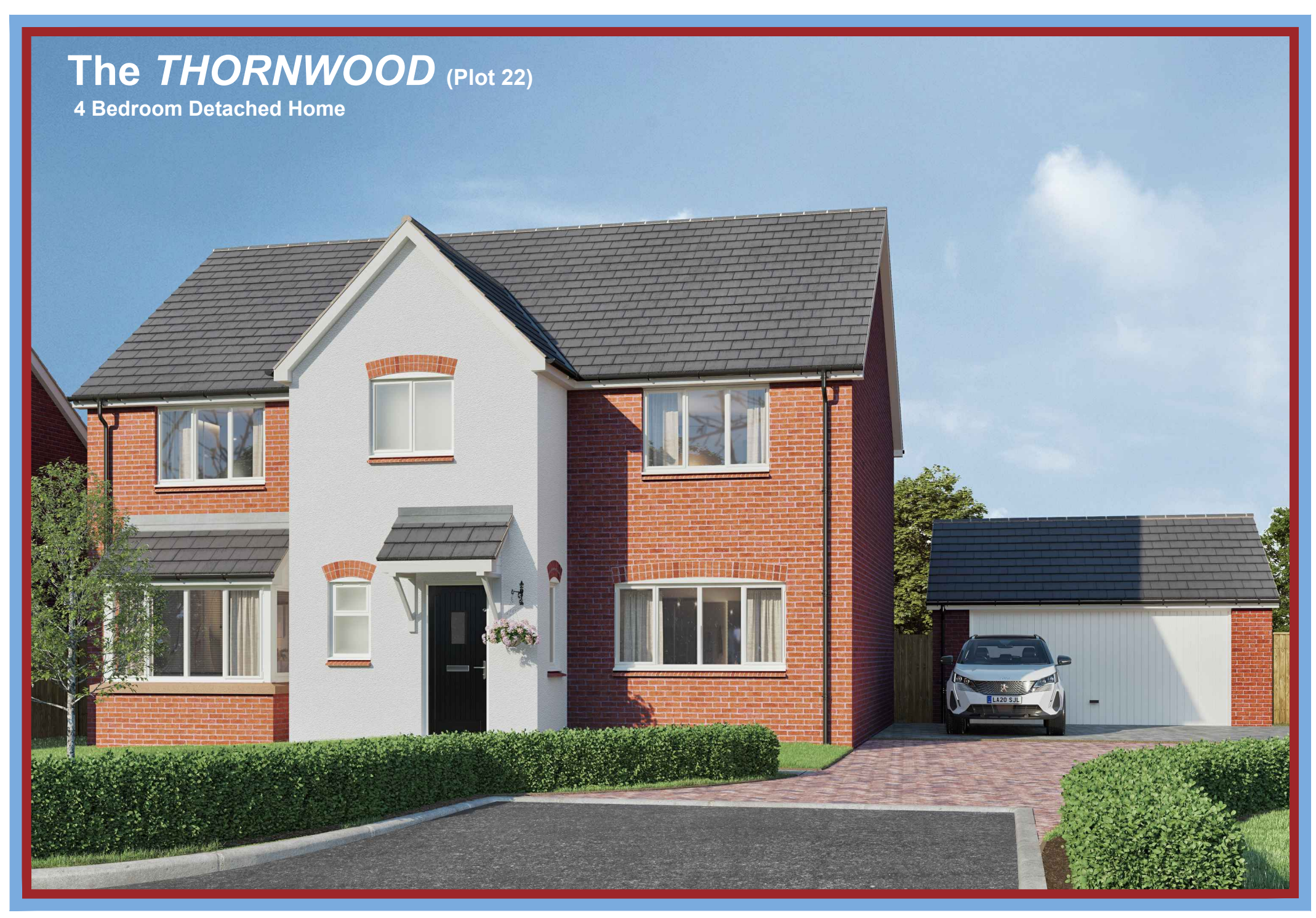
This CGI is an indicative representation of the external finish of this house type on one of the properties on this development. The final appearance of each property may need to be altered during the construction process, particularly when dealing with ground levels. Our sales representative will be happy to discuss the external finish on any specific plot with you.