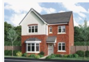
4 Bed 1,381 sq ft Scan to view floorplans

Featuring a dual aspect kitchen and dining room with french doors, a separate laundry room, a bay windowed lounge and a dedicated study, this is a home of real distinction. The four bedrooms include a luxurious master suite.