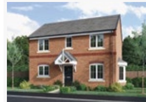
3 Bed 933 sq ft Scan to view floorplans

Both the breathtaking triple-aspect lounge, with its bay window, and the dual aspect kitchen incorporate french doors, creating a bright, inspiring interior. Upstairs, a light-filled landing leads to three bedrooms, one of them en-suite.