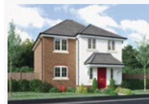
3 Bed 1,102 sq ft Scan to view floorplans

French doors in both the lounge and the dual aspect family kitchen and dining room bring an exciting dynamic to this superb home. The master bedroom features an en-suite.