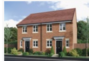
2 Bed 737 sq ft Scan to view floorplans

With its ergonomic kitchen and a bright living and dining room that features french doors opening on to the garden, adding a focal point as well as flexibility, this is a welcoming and comfortable home.