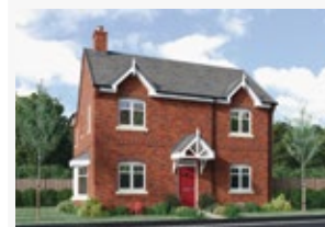
4 Bed 1,290 sq ft Scan to view floorplans

Four dual-aspect rooms, an elegant bay window in the dining room and french doors in both the lounge and the kitchen create an unmistakably opulent appeal. The en-suite bedroom adds a note of luxury.