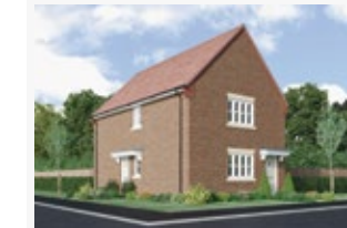
1 Bed 510 sq ft Scan to view floorplans

An L-shaped hall opens on to a beautifully designed open-plan living area that combines convenience with contemporary style to provide a perfect backdrop for modern living. The generously sized hall cupboard adds a practical touch.