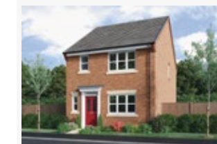
3 Bed 956 sq ft Scan to view floorplans

French doors add a light, airy, appeal to the welcoming and practical kitchen and dining room, creating a convivial setting for relaxed entertaining. An en-suite master bedroom adds convenience to comfort.