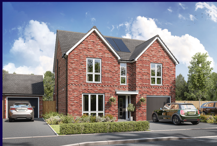
A Four bedroom home, perfect for families and professionals