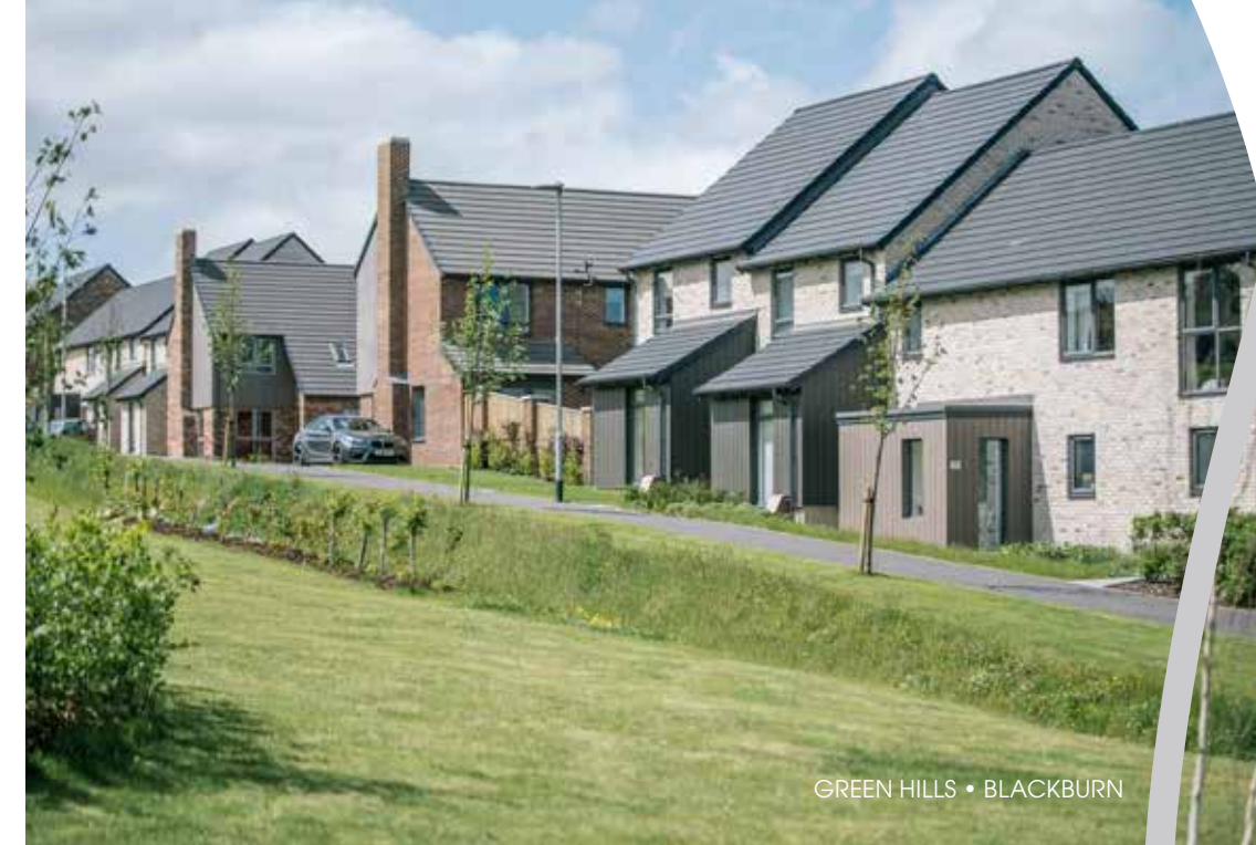
GREEN HILLS • BLACKBURN