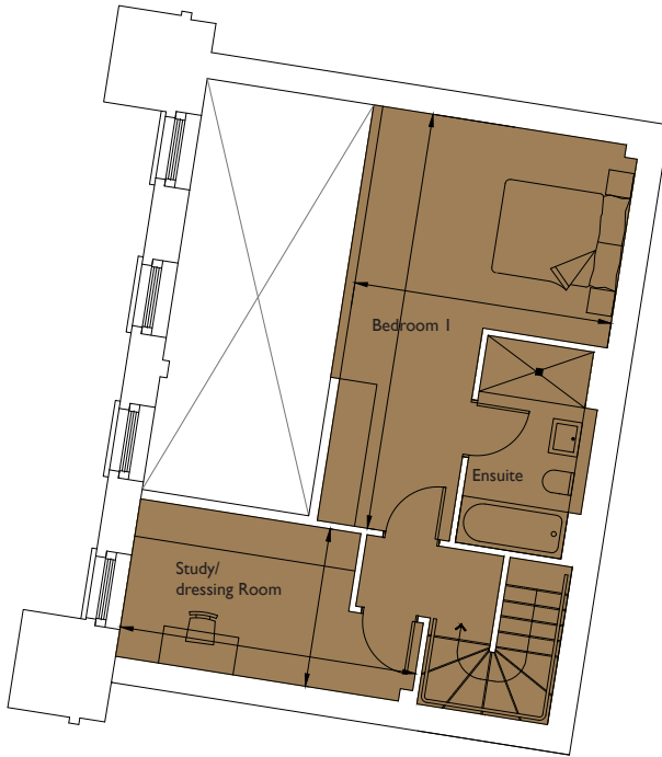
First Floor Mezzanine